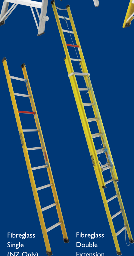
Fibreglass Double Extension