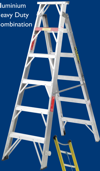
Aluminium Heavy Duty Combination