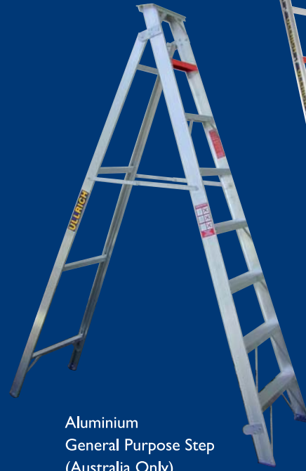
Aluminium General Purpose Step (Australia Only)