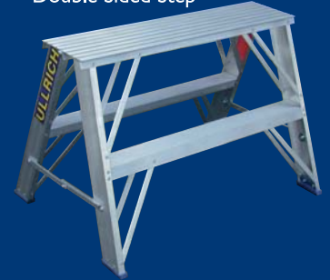
Aluminium Double Sided Step